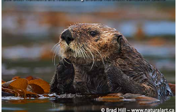
Sea otter numbers are rebounding around northern Vancouver Island

During the evenings we will anchor among the numerous islands and bays of the Broughton Archipelago. Here we may see a Black Bear foraging through the rich intertidal or Great Blue Herons fishing atop the abundant kelp beds. These islands provide us the opportunity to paddle one the Ocean Light II kayaks and explore our calm protected anchorage.