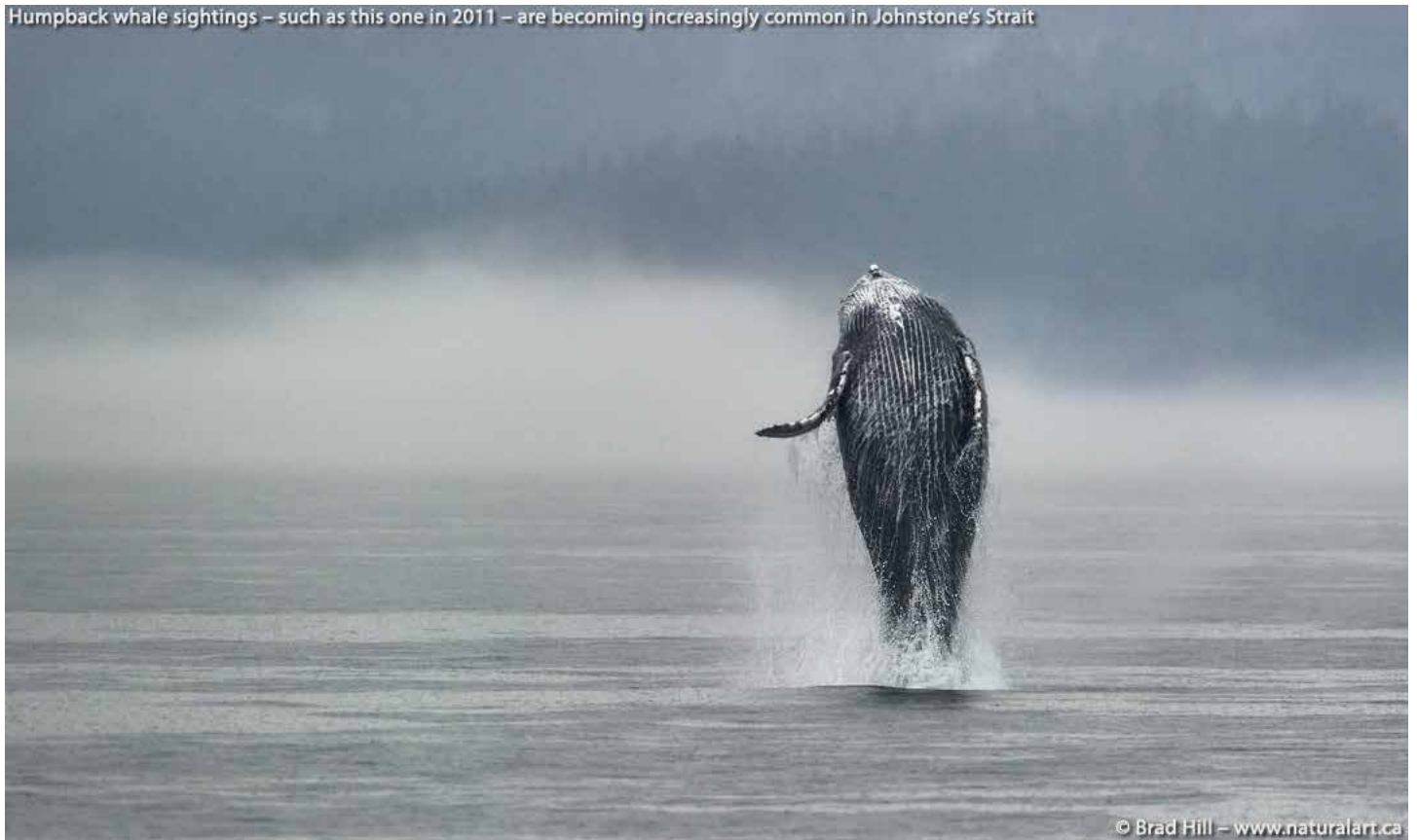
Humpback whale sightings – such as this one in 2011 – are becoming increasingly common in Johnstone's Strait

may bring your own drinks to be consumed in moderation and only when the anchor is down for the night. We will not tolerate excessive drinking on our vessel. Clients have the option to assist in food gathering and meal preparation. If you have particular dietary restrictions, please let us know well in advance.