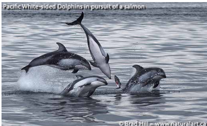
Pacific White-sided Dolphins in pursuit of a salmon

Email: adventure@oceanlight2.bc.ca Phone: 604-328-5339