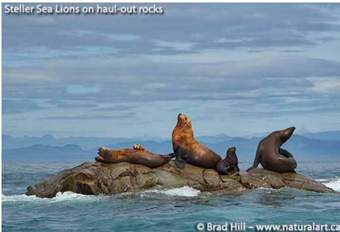
Steller Sea Lions on haul-out rocks